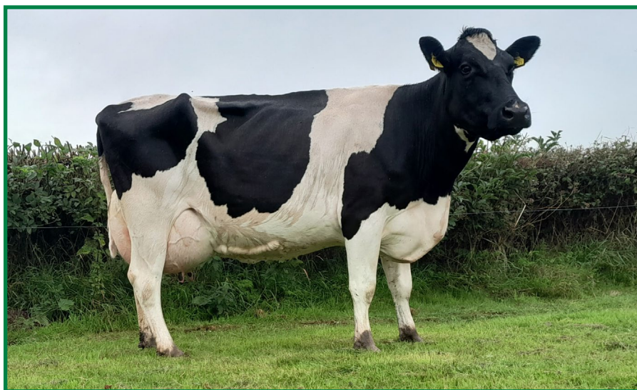
Family Member Mountain Jubularis Rosie 3 EX93 2E All Ireland Awards 23 Honourable Mention Pure Friesian Cow in Milk