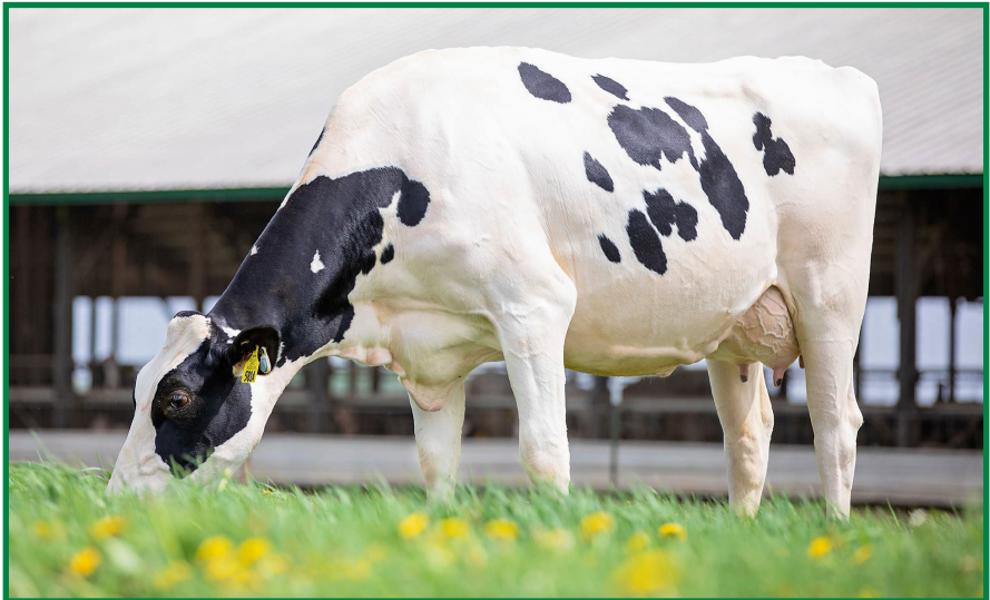
Gdam of Sandy Valley Eifel (sire of lot 4): Sandy-Valley Eternity EX-91