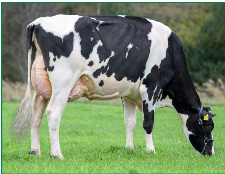
Dam of Drouner K&L Augustus P Red: Drouner K&L Aiko 1557 RDC VG-89