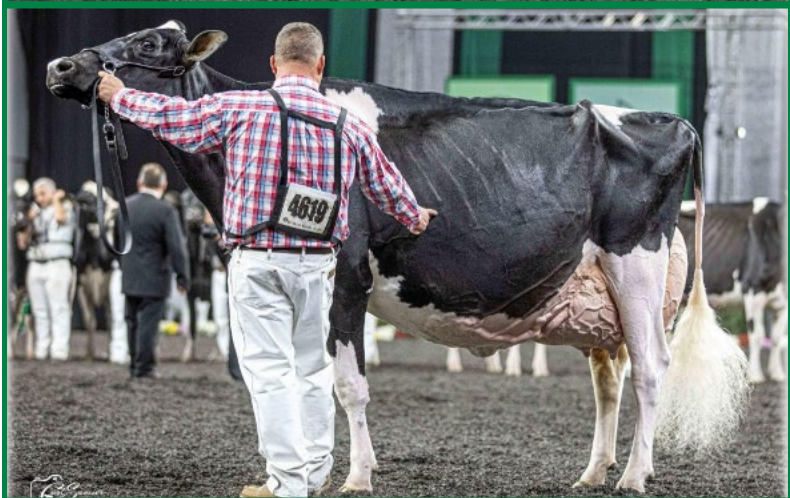
GDam of Lot 3: MS Beautys Black Velvet EX-96