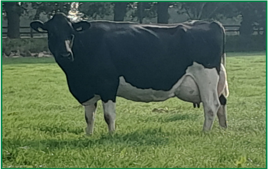
Lot 8- Family member - Mountain Spitfire Rosie 3 -All Ireland Awards 23 Reserve Irish Pure Friesian Cow in Milk